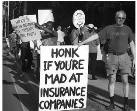
ACLP members and HR 676 supporters protest at the Gainesville office of BlueCross/BlueShield at last year's National Day of Action.